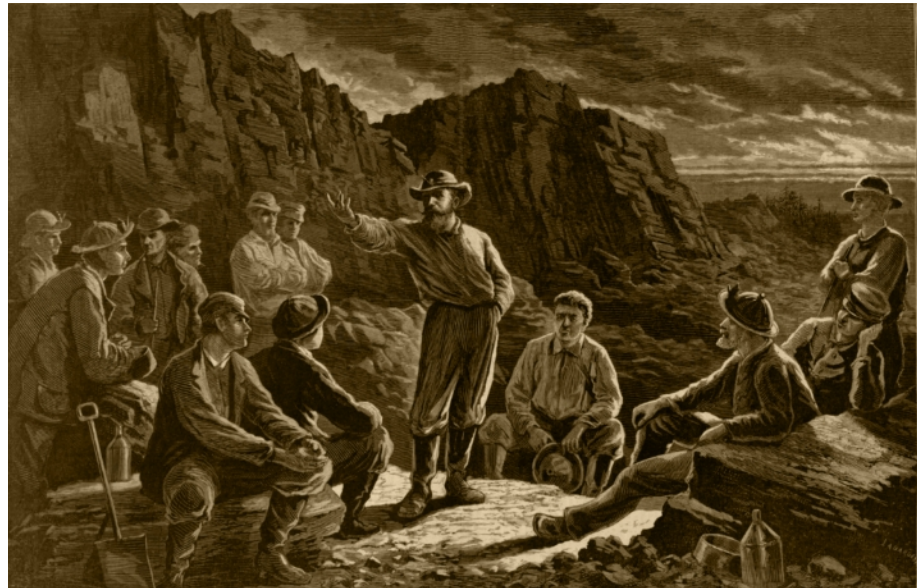
The subjects of two upcoming programs: (Top) An illustration of an 1874 Harper's Weekly article on the Molly Maguires. (Right) A 1920s photo of an inclined coal plane.