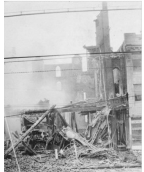
Photos of downtown Pottsville fires (left) at the F.W. Woolworth store, Centre and Mahantongo streets in 1950, and (right) at the Centennial Hall building in the 200 block of North Centre Street in 1916.