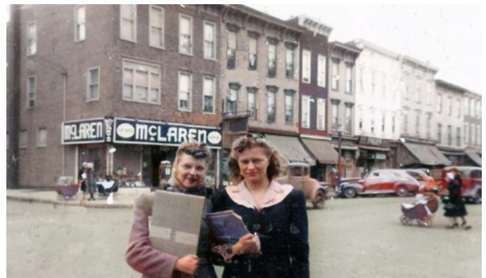
The 100 block of West Centre Street in Mahanoy City before it was destroyed by fire in 1945.